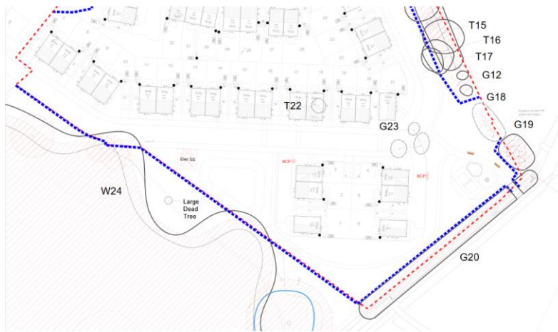
Figure 3: Extract from revised Tree Protection Plan ref. 1613-002 Rev E.