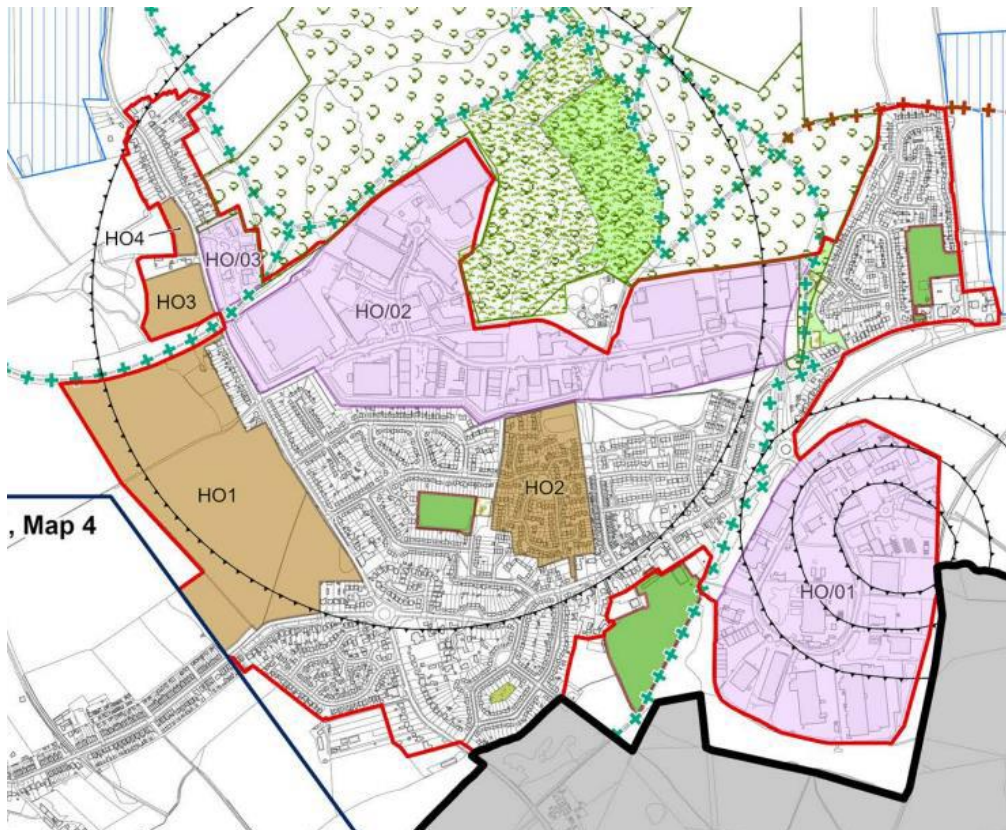
Figure 3: Holmewood NEDDC Local Plan provisions

However, as the application is for affordable housing on a site that is adjacent to the settlement boundary of Holmewood, it is noted that policy LC3: Exception Sites for Affordable Housing within the NEDDC Local Plan enables affordable housing development in the countryside provided all the criteria in the policy have been met. The evidence also indicates that there is a need for affordable housing within the district.