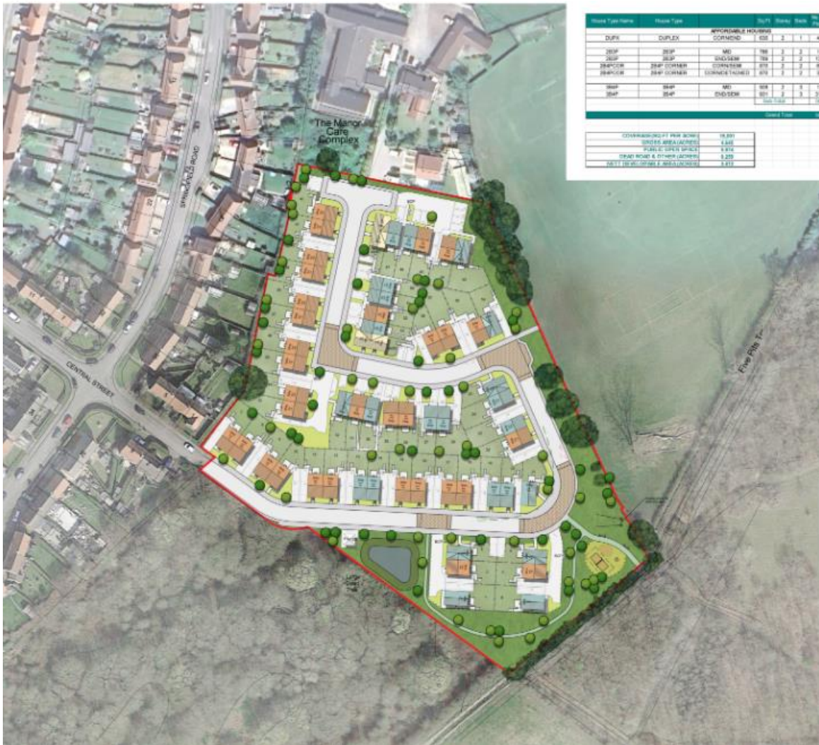
Figure 1: Planning Application 24/00257/FUL. Planning Layout Drawing No 2412.01. Rev. M.