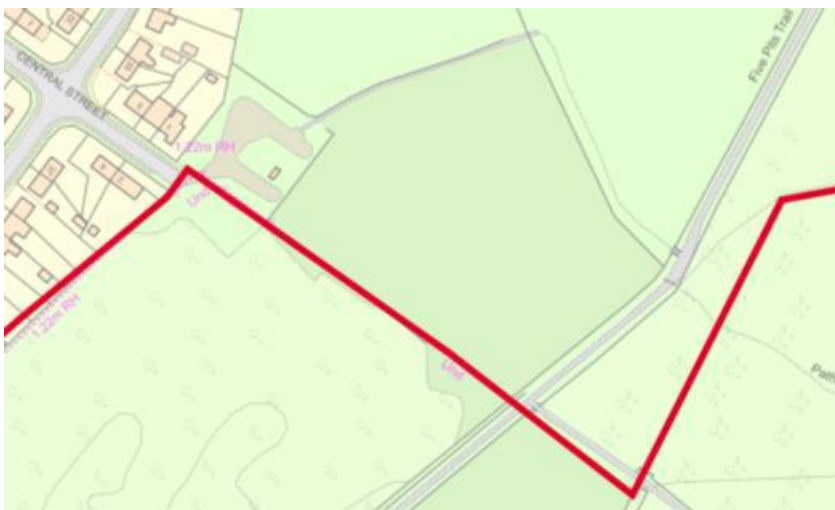
Figure 2: Bolsover district boundary Source: Site Central Street, Holmewood. Source: