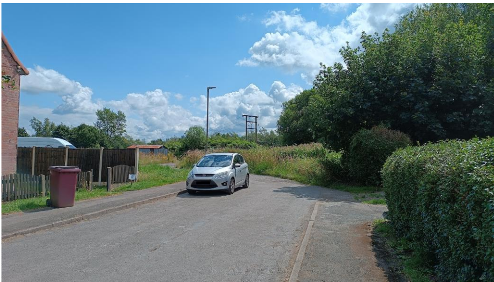
Photograph 1: Case officer photo showing the view from the access point at the end of Central Street, Holmewood

Vehicular access to the development would be via an extension to Central Street, which includes upgrading the existing track that leads to an existing former garage site. It is this part of the development within Bolsover which would include the removal of part of an exiting grassed/planted margin between the existing track and the adjacent mature woodland, also within the Bolsover area, which is to the southwest (see photograph 1 below).